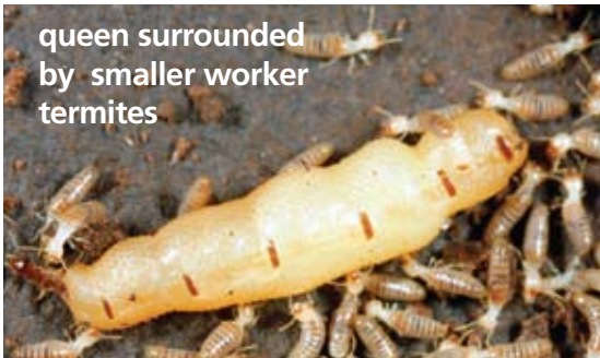
queen surrounded by smaller worker termites